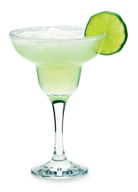
Miranda A drink for feeling deeply. Margarita.